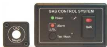
WG100-L-V LPG sensor gas control system