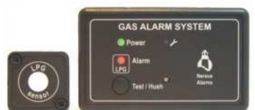
WG100-L. LPG sensor alarm system

WG100-L - Single Sensor LPG Gas Alarm System £235.00 inc VAT