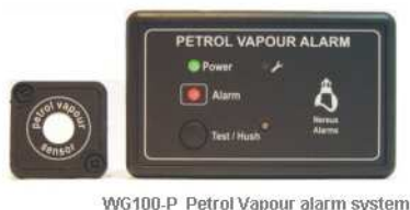
WG100-P Petrol Vapour alarm system

WG100-P - Single Sensor Petrol Vapour Alarm System £235.00 inc VAT