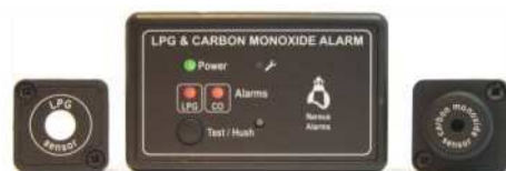
WG200-LC LPG &amp; Carbon Monoxide alarm system

WG200-LC - 2 Sensor LPG & CO Alarm System £293.75 inc VAT