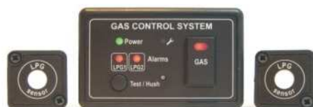
WG200-LL-V 2 LPG sensor gas control system

WG200-LL-V - 2 Sensor LPG Gas Control System £340.75 inc VAT