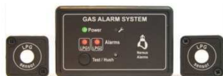
WG200-LL. 2 LPG sensor alarm system

WG200-LL - 2 Sensor LPG Gas Alarm System £293.75 inc VAT