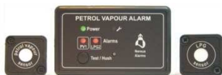
WG200-LP LPG & Petrol Vapour alarm system

WG200-LP - 2 Sensor LPG & Petrol Vapour Alarm System £293.75 inc VAT