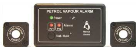
WG200-PP 2 Petrol Vapour sensor alarm system

WG200-PP - 2 Sensor Petrol Vapour Alarm System £293.75 inc VAT