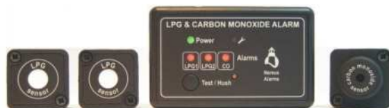
WG300-LLC LPG &amp; Carbon Monoxide alarm system

WG300-LLC -3 Sensor LPG & CO Alarm System