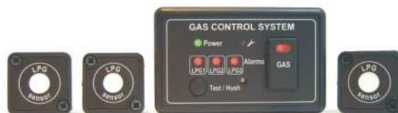
WG300-LLL-V 3 LPG sensor gas control system